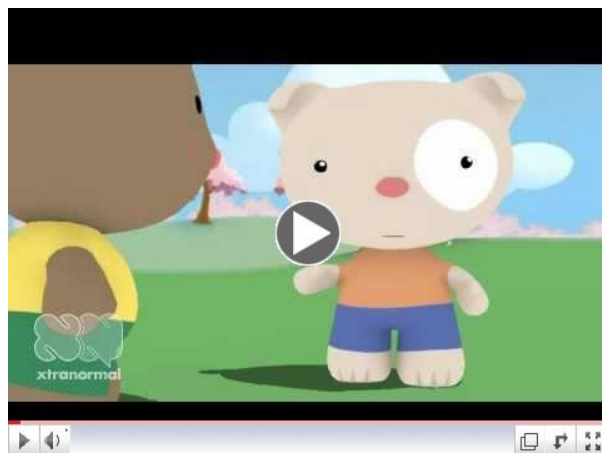
Eyesore or ISAR

As ISAR's supporters know, every week we communicate our message and current activities to thousands of people throughout the world via our e-newsletter, postal newsletter, website, blog, Twitter, and online communities such as Facebook and Myspace.